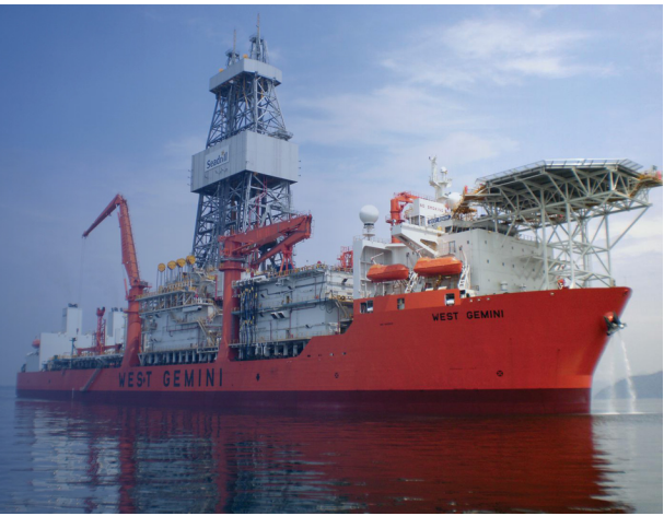
West Gemini – Side View

The West Gemini is a 6th generation ultra-deepwater dual activity drillship with operational history in West Africa.