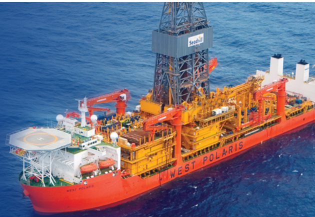
West Polaris – Side View

The West Polaris is a 6th generation ultra-deepwater dual activity drillship with operational history in Brazil, India and West Africa.