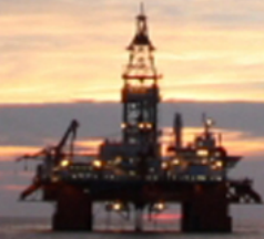
West Aquarius – Side View

The West Aquarius is a 6th generation ultra-deepwater offline activity harsh environment semi-submersible with operational history in Southeast Asia and Canada.