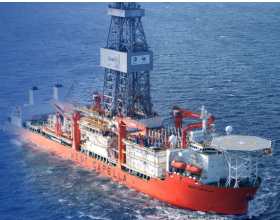
West Capella – Side View

The West Capella is a 6th generation ultra-deepwater dual activity drillship with operational history in Southeast Asia and West Africa.