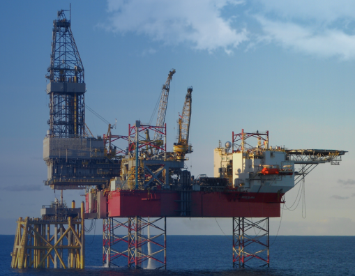
West Elara General Arrangement – Side View

The West Elara is an independent leg cantilever jack-up outfitted for offline activity with operational history in the Norwegian Sector of the North Sea.