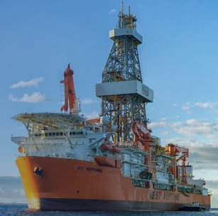
West Neptune – Side View

The West Neptune is a 7th generation ultra-deepwater dual activity drillship with operational history in the U.S. Gulf of Mexico.