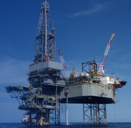
West Prospero General Arrangement – Side View

The West Prospero is an independent leg cantilever jack-up with operational history in Northeast Africa and Southeast Asia.