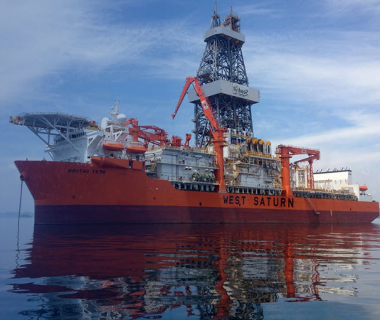
West Saturn – Side View

The West Saturn is a 7th generation ultra-deepwater dual activity drillship with operational history in West Africa and Brazil.