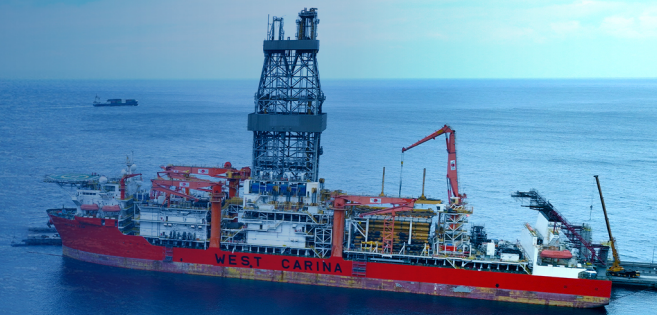
West Carina – Side View

The West Carina is a 7th generation ultra-deepwater dual activity drillship with operational history in Southeast Asia and Brazil.