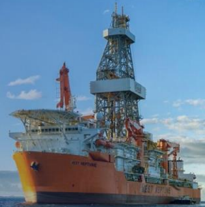
West Neptune – Side View

The West Neptune is a 7th generation ultra-deepwater dual activity drillship with operational history in the U.S. Gulf of Mexico.