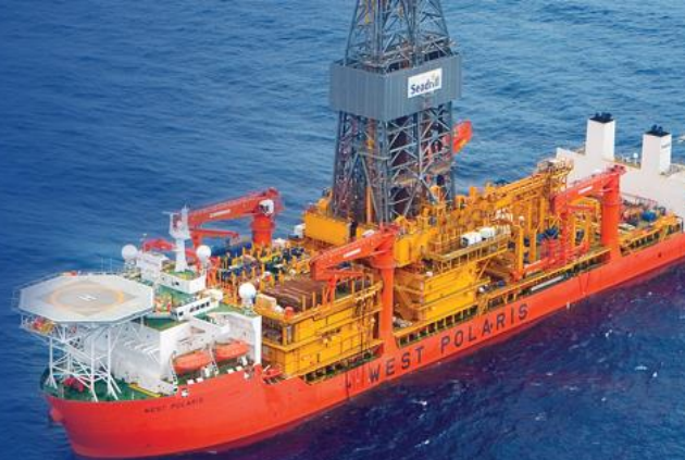
West Polaris – Side View

The West Polaris is a 6th generation ultra-deepwater dual activity drillship with operational history in Brazil, India and West Africa.